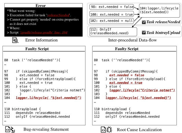
Figure 2: Workflow of Dataflow-based Fault Localization

4.1.1 Error Information Extraction. A build log tends to record much information involving various stages of a build process, such as initialization and task execution. Therefore, HoBuFF first parses the build log to extract the message related to the build failure, called error message. Due to the standard form of Gradle build logs, there exist error-indicating headers in the log to mark the error message. As shown in the error message of the illustration example, there are two error-indicating headers: (1) “* What went wrong:” explaining the symptom of the build failure; (2) “* Where:” indicating the location of the bug-revealing statement(s). Following the existing work [23], HoBuFF utilizes the error-indicating headers to extract the error message from a build log. In the error message, Gradle always tries to report in which project and in which task, the build failure occurs, which are reported in standard form and